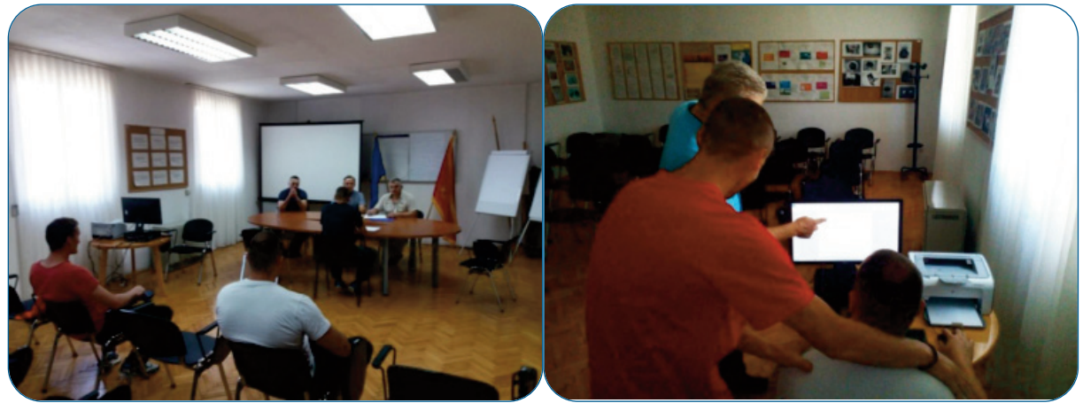
*Training of prisoners - ZIKS

The most significant achievement of the project is that those who passed the training received certificates that are not institutionally related to the ZIKS(Institute for execution of criminal sanctions). For the first time, prisoners passed the training with licensed lecturers as we placed them in front of the commission and everything was organized as if lecturers and commission were parts of the institutions outside the prison walls.