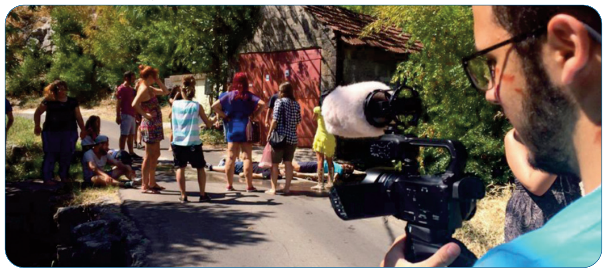
* "SIGEMBR" movie recording

The film "SIGEMBR" is the product of several months of work of several organizations: Association GEYC (Romania), Center for Youth Development - PRONI (BiH), Identities (Italy), Green spirit (Greece), Seiklejate Vennaskond (Estonia), IdejNet (Serbia) and NGO "35mm". The project is funded by the European Union within the Erasmus + Program.