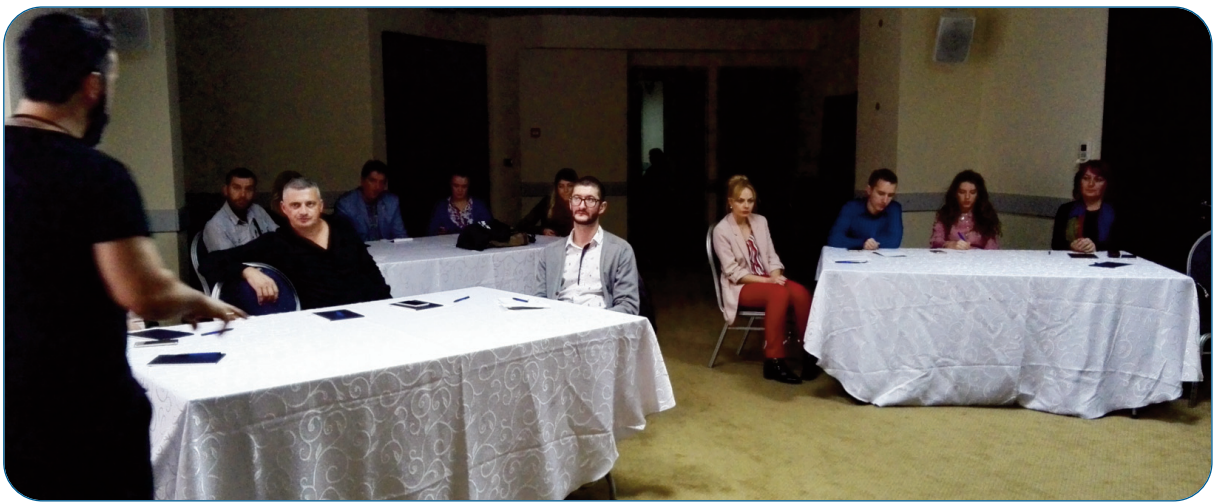
* "Fighting cronyism" training

The practice of bias during the process in the allocation of jobs and other benefits to friends or