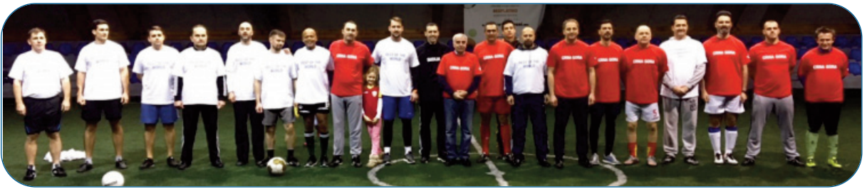
*Podgorica, Humanitarian game on International day of human rights

On this occasion we organized several events: