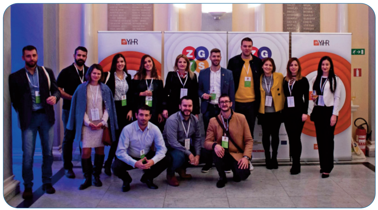
*Zagreb Youth Summit

tiators and active participant. In this regard, in April 2017, in cooperation with the members of the Board of directors of RYCO, we organized a round table where we informed all stakeholders about the process itself, as well as the development of the office and expectations in the following period.