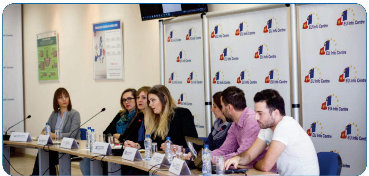
*Presentation of the mobile application "Civic Institute", EU Info Center, Podgorica

A mobile application "Civil Institute" is also in operation, and it has geometric reports and documentation related to violations of workers' rights, patients and consumers. The public was also