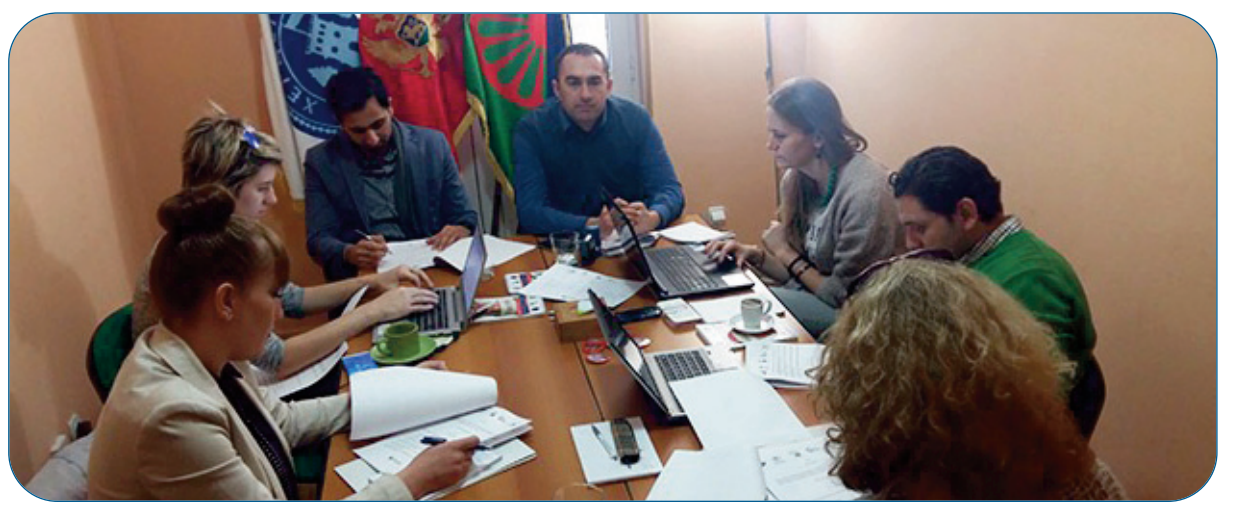
*Podgorica, session of the coalition "Together for inclusion of the Roma and Egyptians trough transparent and sustainable public policies"

In 2017, we became part of the coalition "Together for the inclusion of roma and egyptians through transparent and sustainable public policies", which besides the CA, is composed of the Center for Roma initiatives, Roma youth organization "Phiren Amenca", Center for democratic transition and Young Roma. The project is funded by the Open Society Fund in Budapest.