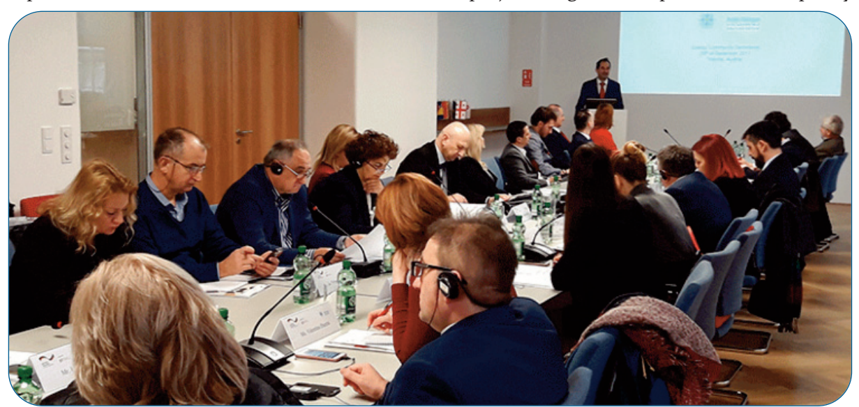
*First Parliamentary European Southeast Forum, Vienna 2017.

In 2017, SDL participated in the organization of the first Parliamentary forum of Southeastern Europe and within the framework of the GIZ ORF-EE project "Regional cooperation and capacity