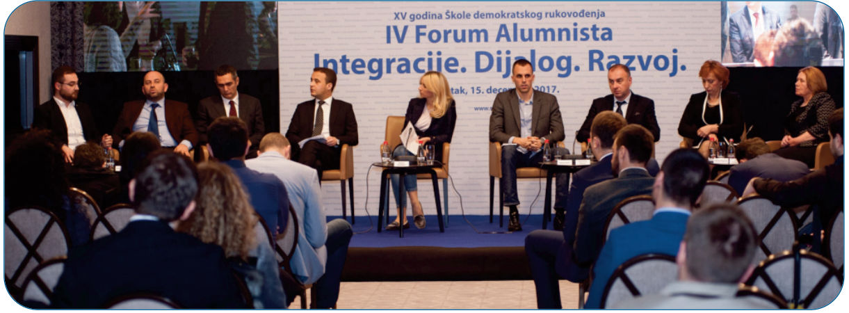
*IV alumni forum and marking of XV years of SDL

At the end of the previous year, we organized the IV Forum of alumni, celebrating 15 years of existence. On the same day, we also awarded diplomas to the XV generation of the School. The Forum