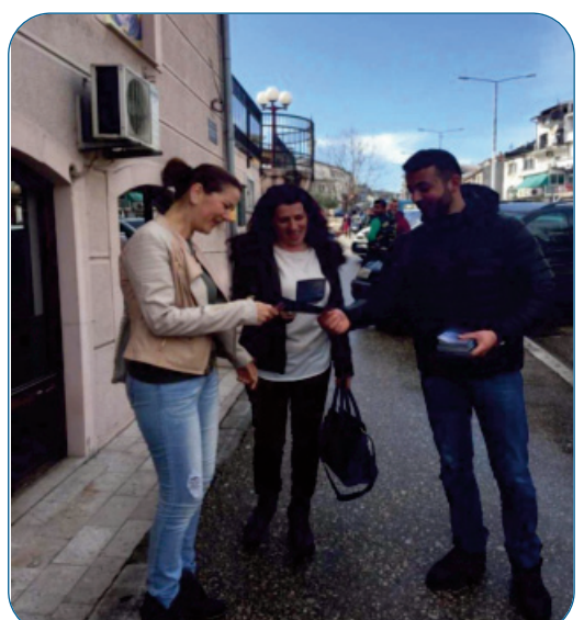
**Sharing flyers on alternative sanctions

Representatives of the GA also visited Montenegrin towns, where they informed citizens about alternative sanctions and while spreading leaflets about this topic, most directly contributed to the spread of awareness on this topic. Our information flyers were also distributed to all Basic courts in Montenegro.