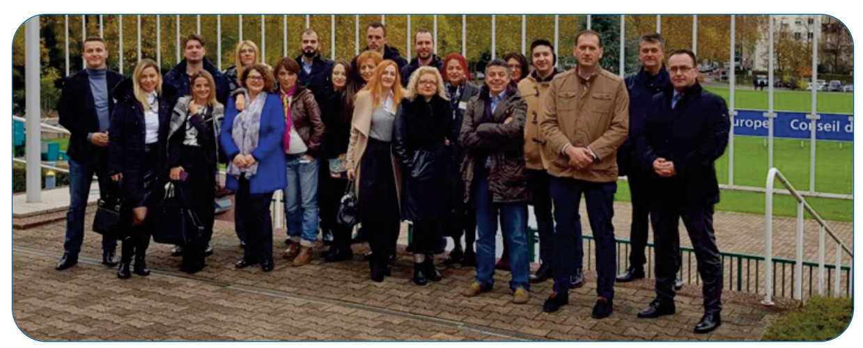
*Delegation of Montenegro participates in the World Democracy Forum 2017.

participants from all over the world had the opportunity to discuss key key challenges for all democracies around the world. During this program we visited the European Human rights court and the Mission of Montenegro to the Council of Europe.