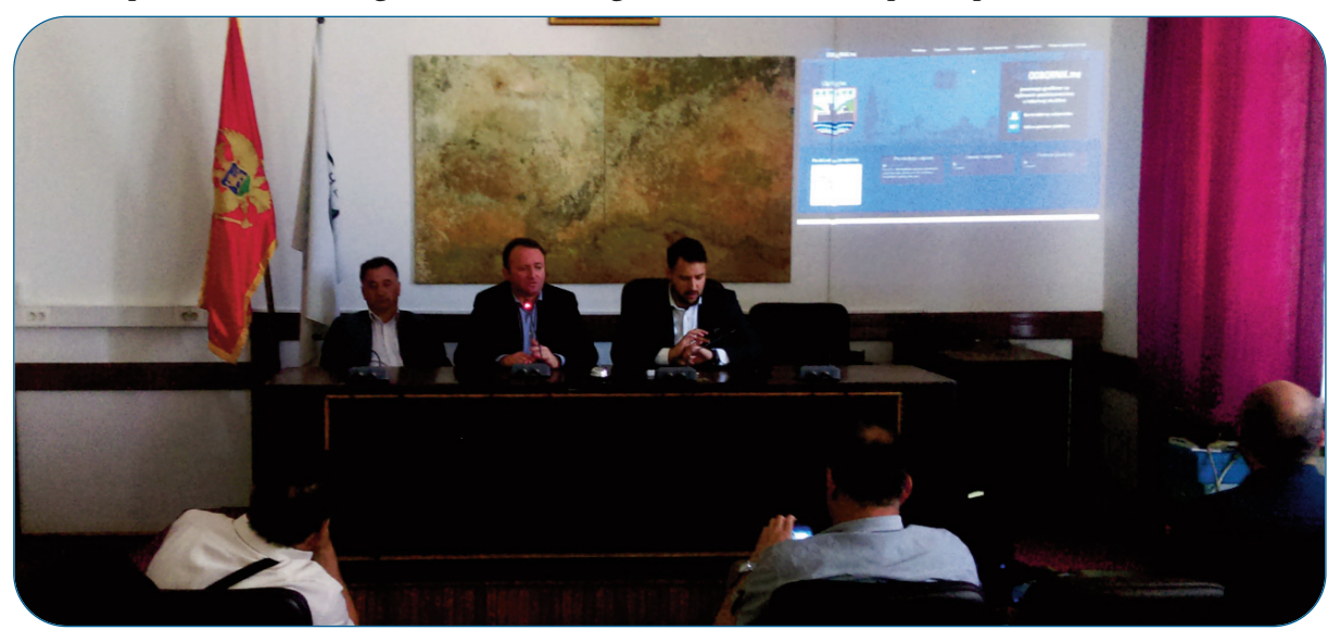
*Berane, presentation of the platform odbornik.me

In addition, the platform also enables direct monitoring of local parliament sessions through live stream links, which aims to increase the accountability and quality of the work of the local representatives themselves. This is a platform whose official realization started in cooperation with the Berane Municipality, but is the basis for further development and expansion of cooperation with other municipalities, especially trough recognizing this way of working and functioning as a basis for creating more responsible local self-governments and greater involvement/participation of citizens.